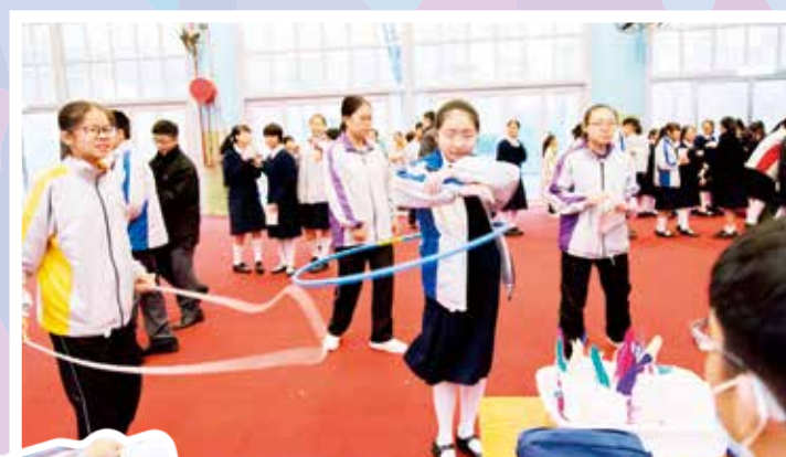
(Everybody move your body~~~ )