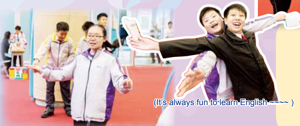
(It's always fun to learn English ~~~~ )