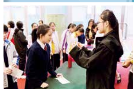
(How many hours of exercise do you need to do a day? Hmmm,,,) )