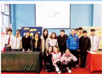
(Day 1 of our English activities)

During the final day of English week, students had the opportunity to recap what they have learnt through the English week. In the afternoon, they went in the new chapel to take part in activities designed by teachers. The games included a matching game about healthy food, a mini-basketball game, a guessing game, food riddles and an exercise corner.