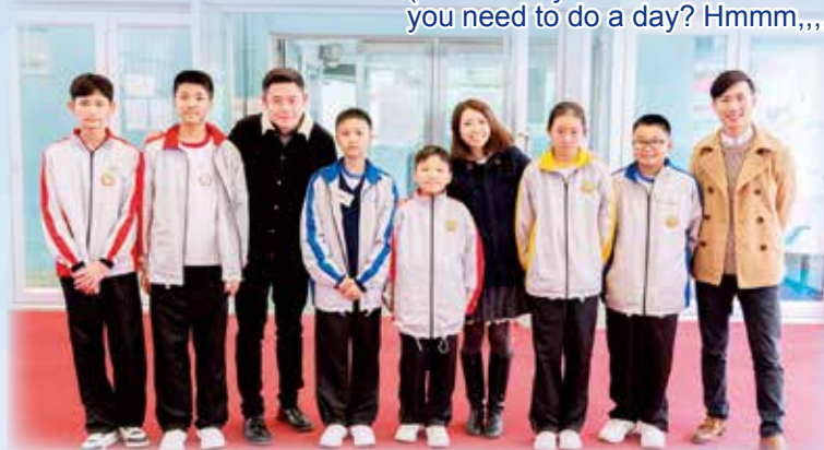
(Our English Helpers ~~~~~)